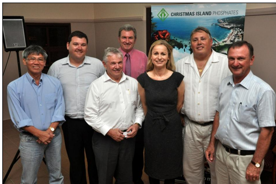
CHRISTMAS ISLAND PHOSPHATE'S COMMERCE DINNER

There are a number of organisations which are working to promote and protect the wellbeing of communities of IOT, some of which I have the privilege of Chairing on behalf of the Minister for Home Affairs. I intend to use this newsletter to keep you up to date with their work also. I am also exploring other possible forms of communication.